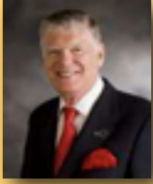
Rotary International President 2009 - 2010