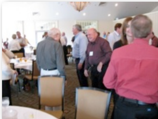
Fellowship Prior to Club Meeting