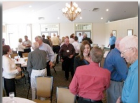
Fellowship Prior to Club Meeting