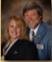
Rotary District 5890 Governor 2009 - 2010